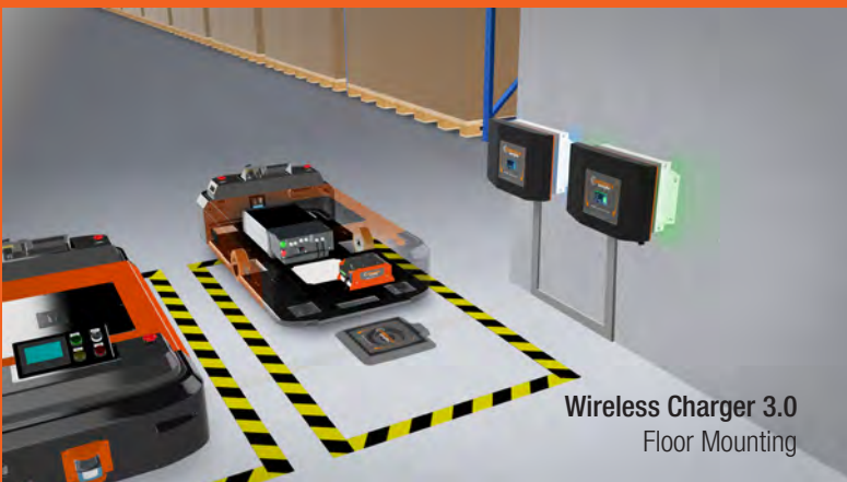
Wireless Charger 3.0 Floor Mounting

The MPU (Mobile Power Unit) is taking up the current induced in the IMP and provides a stable DC output towards the battery. The output voltage range is 21 to 59 V DC. The wireless charger can charge on demand when communication to the battery management system is active, or to set values when no communication is present.