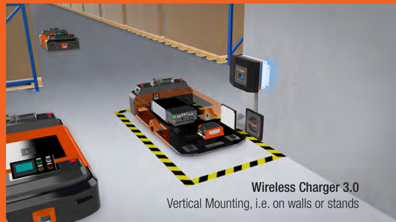
Wireless Charger 3.0 Vertical Mounting, i.e. on walls or stands